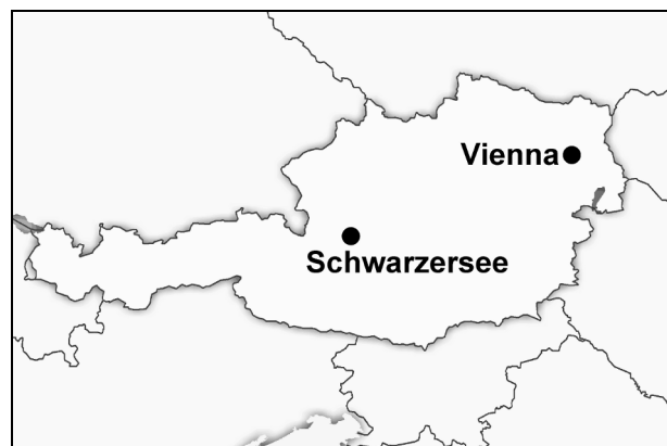
Fig. 1. Map of Austria showing the location of Schwarzersee.

The studied wood is a part of a multi-century dendrochronological scale which comes from small area situated around a mountain lake — Schwarzersee (47°31'N, 13°49'E, 1450 m a.s.l.). This lake lies in the region of the Dachstein Mountains which belong to the Limestone Alps (Fig. 1). Subfossil wood used for chronology construction was collected in the form of stem disks from the trunks deposited on the bottom of Schwarzersee. These trunks originated from the trees growing on the nearby mountain slopes. Also the present-day wood was sampled from the trees growing around the lake (Grabner et al. , 2006). The whole chronology material contains the wood from spruce ( Picea abies (L.) Karst.) and larch ( Larix