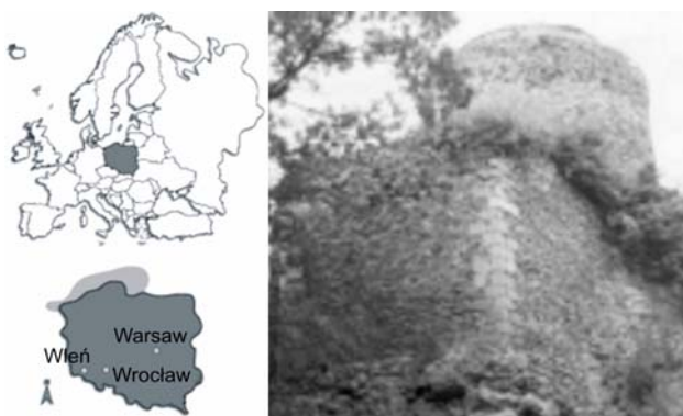
Fig. 1. Location: Wleń Town, Lower Silesia province (SW Poland); front elevation of Wleń castle